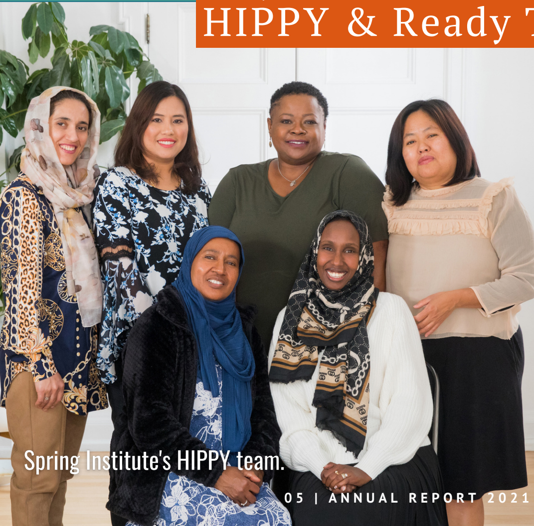
Spring Institute's HIPPY team.