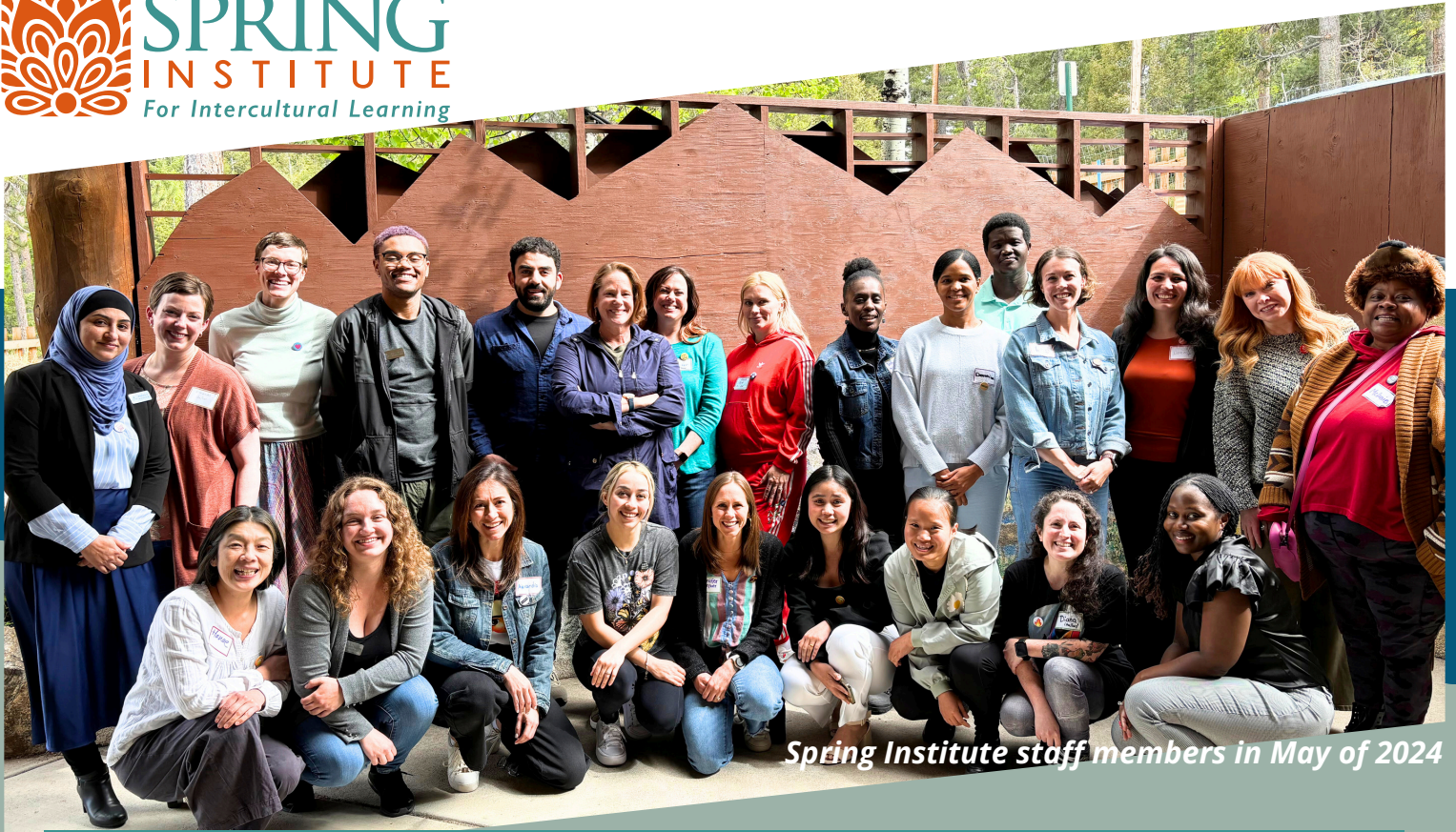
Spring Institute staff members in May of 2024

Thank you for collaborating in our mission to build a thriving intercultural community through learning, language access, and advocacy.