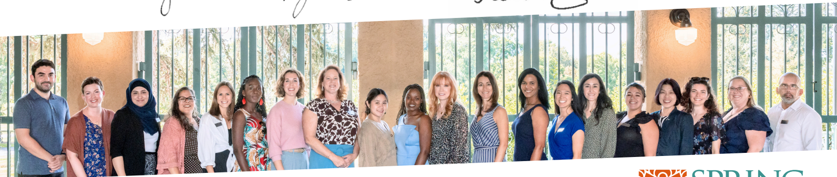
Spring Institute staff members in September of 2023